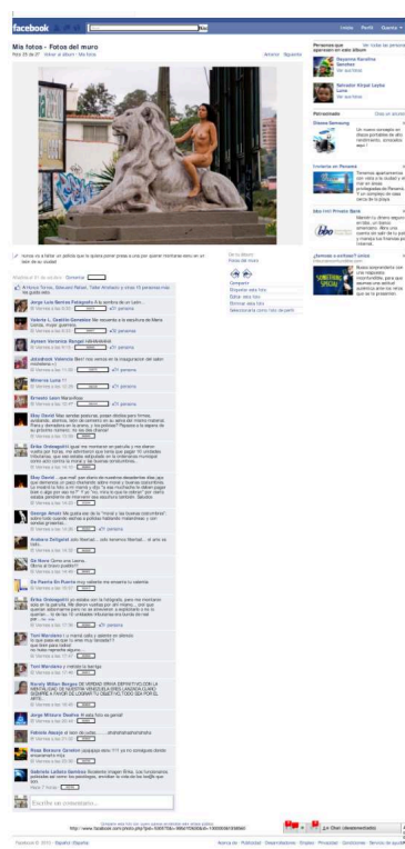
undated.