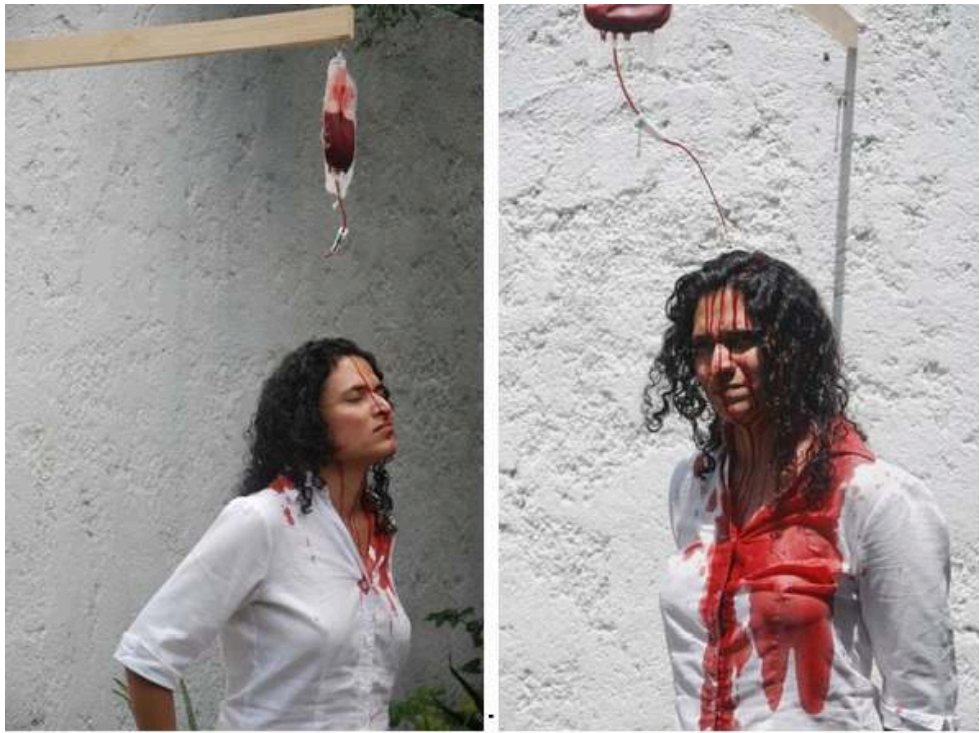
Cicatrices en la cabeza , performance, 2013.

Galería GBG, Caracas.