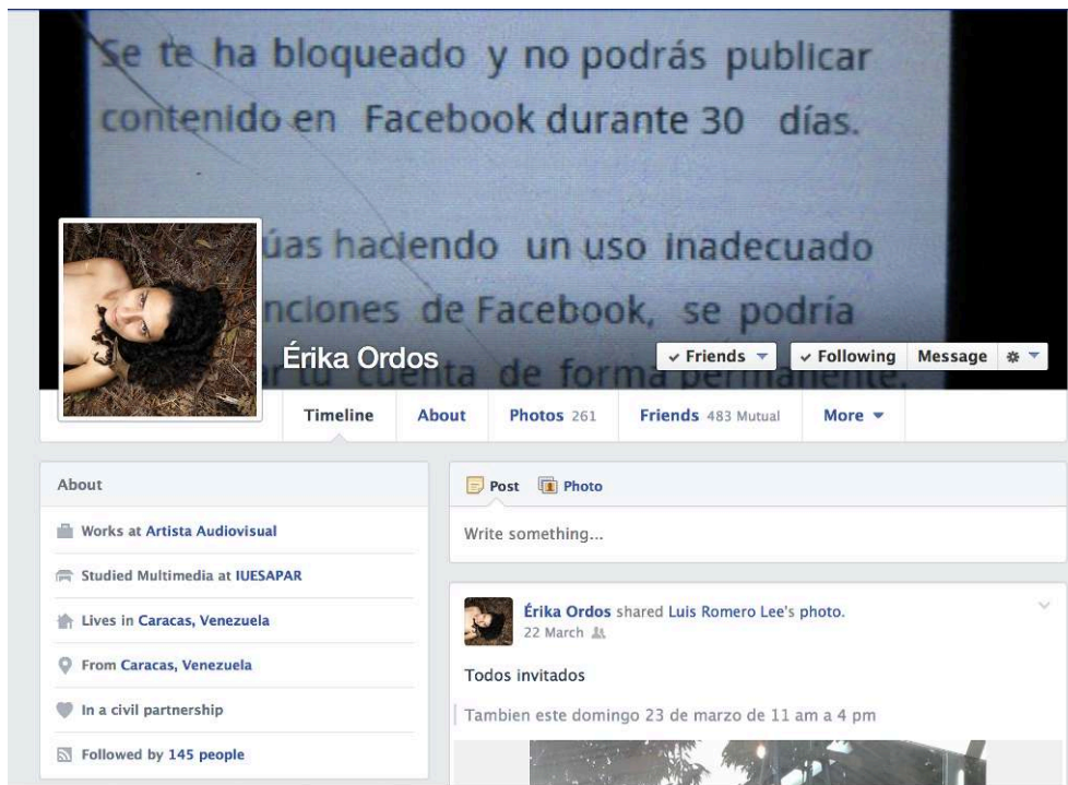
Screen shot of Ordosgoitti's Facebook profile, March 2014.